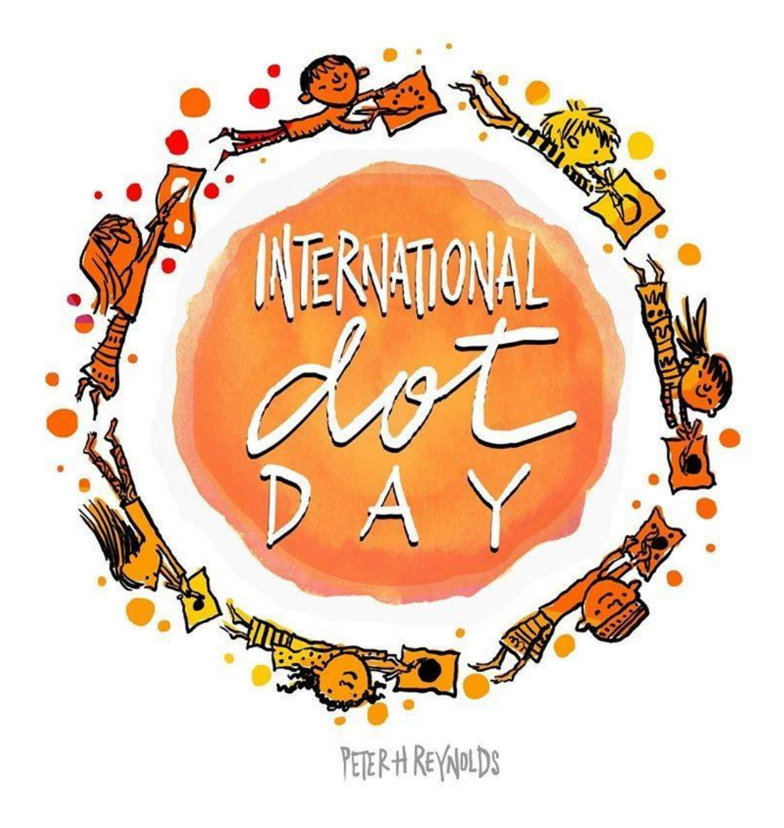
Art © Peter H. Reynolds. Permission granted to reproduce all art in this release for non-commercial use.